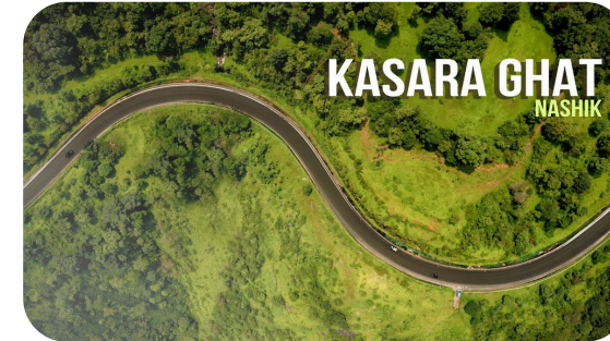
KASARA GHAT Min/Km