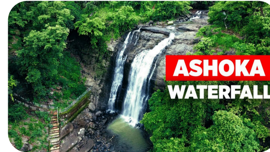
ASHOKA WATERFALL Min/Km