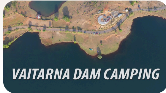
VAITARNA DAM Min/Km