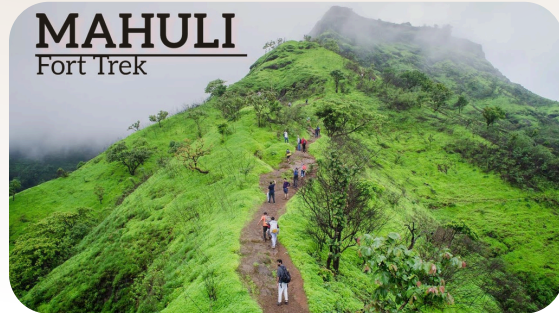
MAHULI FORT Min/Km